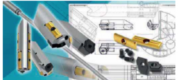
TBT supplies indexable insert single-lip drilling tools with diameters from 12 to 28 mm. For cross-drilling, there are also variants with a long head

Finally, the "softer" arguments are convincing: since tools with interchangeable blades do not have to be reground, they incur less running costs and are always available. Furthermore, many auxiliary