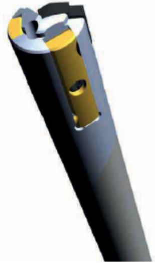
WP-ELB series 10 drilling tool: The TBT indexable insert single-lip drills also include replaceable carbide guide rails to guide the tools in the bore. The strips additionally smooth the bore, which is why the best surfaces are created

"In the meantime, we have been able to make many comparisons between single-lip drills with indexable inserts and brazed cutting edges being used by our customers and subcontractors. The feed rates are always higher, sometimes by a factor of 2 to 3, and the surfaces are better," continues Thomas Bruchhaus. "In addition to the cutting edges, the guide rails also contribute to their high quality, as they have the last contact with the bore. The rails are