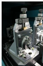
The device constructed by TBT offers four degrees of freedom for workpiece adjustment. The image shows the scale for the 360° rotation of the workpiece and the counter for height adjustment.